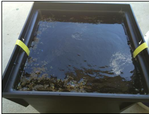
Above: Start of trial