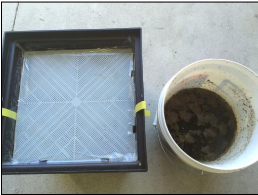
Above: Trial set up

Below is a trial on sludge from IDEA sewage plant sludge storage pond with For Earth Aeration and bacteria dosing system installed.